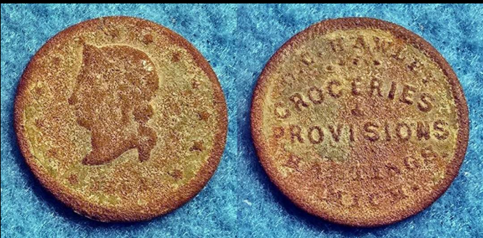
FOB, BADGE, TOKEN